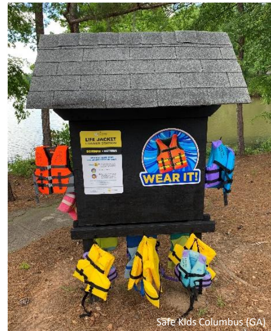
Safe Kids Columbus (GA)